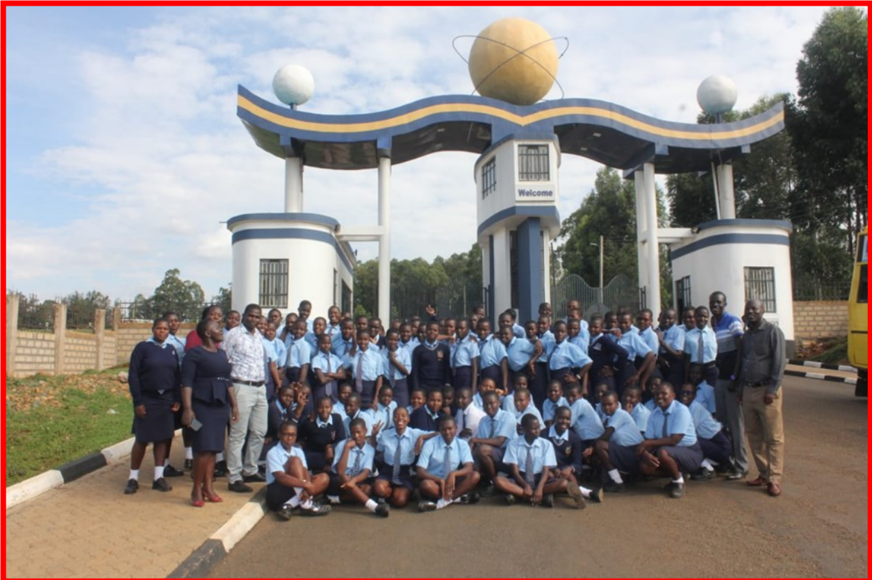
High school girls were highly motivated when they visited local university This gave them a positive attitude towards education.