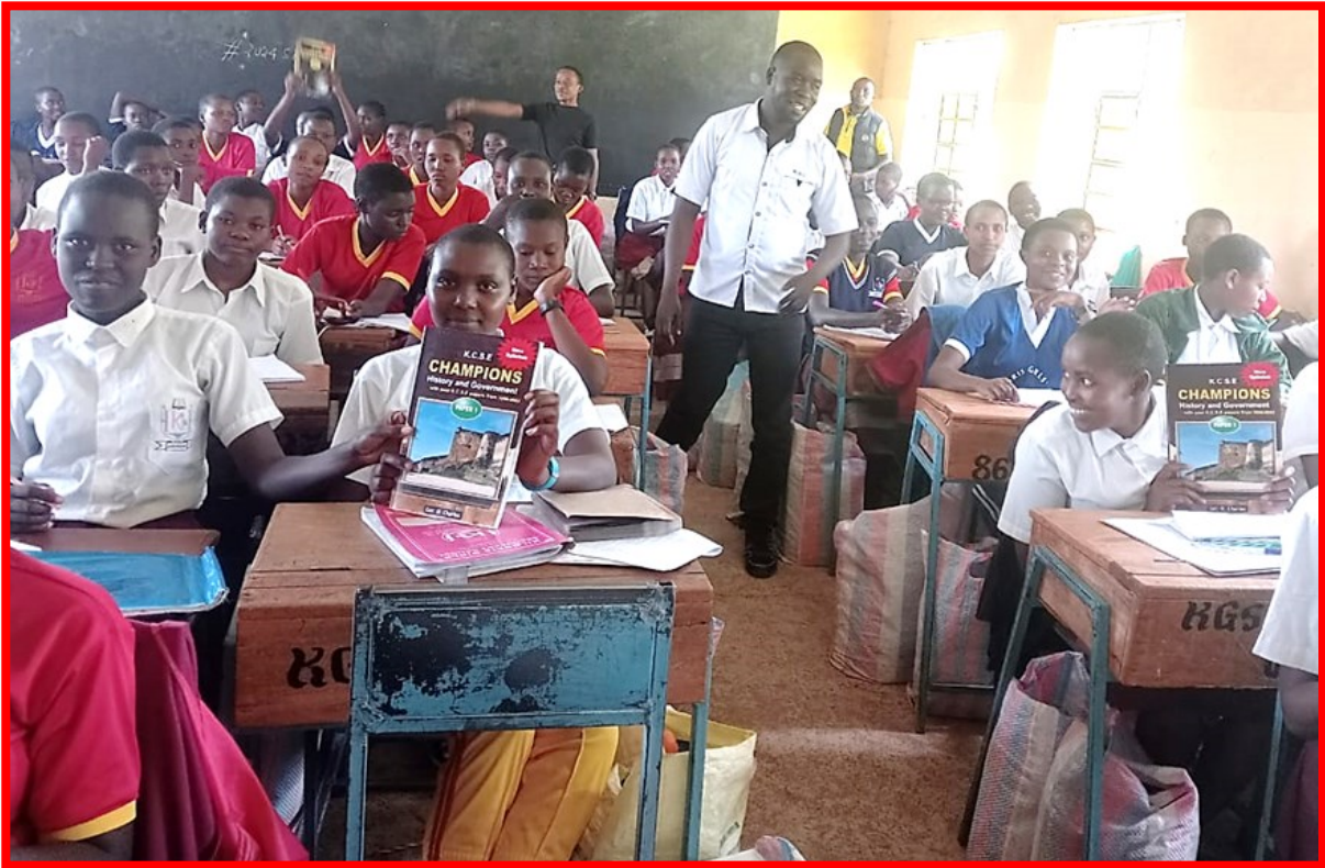
History teacher taking girls through history lesson in class.